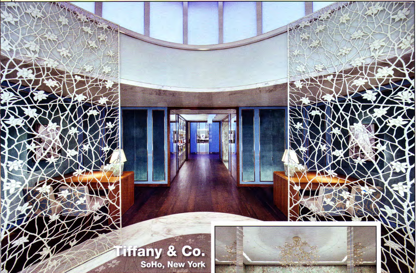
Tiffany & Co. SoHo, New York