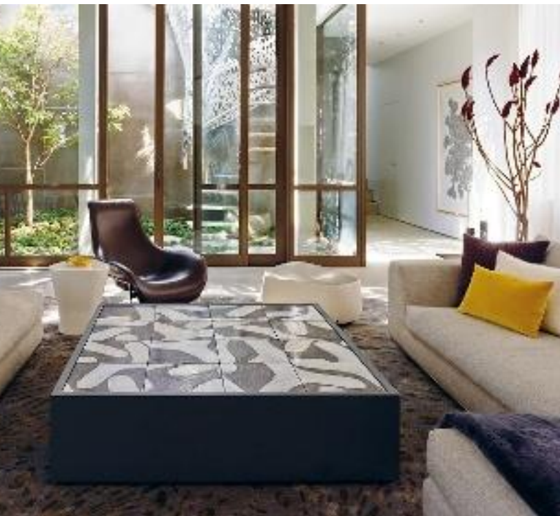
Two views of the living area: Powell sofas by Rodolfo Dordoni for Minotti , Mart armchair by Antonio Citterio for B&B Italia , custom coffee table; carpet by Tai Ping; Sarus lamp by David Weeks.

In the background, the dining zone with a custom table, Flavin chairs by Rodolfo Dordoni for Minotti. In the living room a small green courtyard has been created, with a staircase leading to the roof garden. To the side, plans of the roof garden and the apartment below.